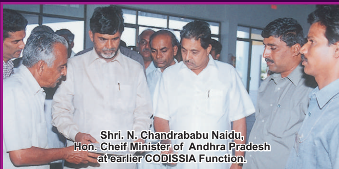
Shri. N. Chandrababu Naidu, Hon. Chief Minister of Andhra Pradesh at earlier CODISSIA Function.