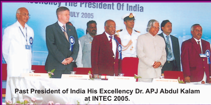
Past President of India His Excellency Dr. APJ Abdul Kalam at INTEC 2005.