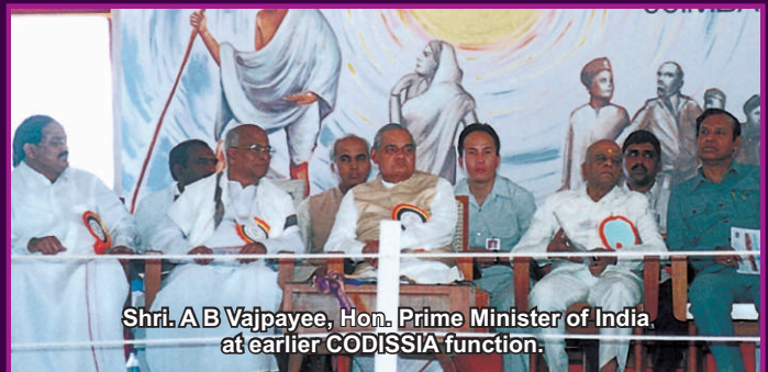
Shri. A.B. Vajpayee, Hon. Prime Minister of India, at earlier CODISSIA function.