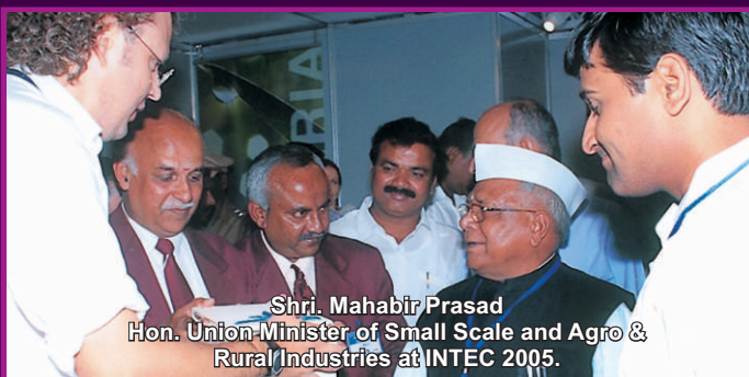
Shri. Mahabir Prasad Hon. Union Minister of Small Scale and Agro & Rural Industries at INTEC 2005.