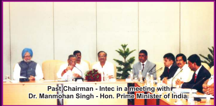
Past Chairman - Intec in a meeting with Dr. Manmohan Singh - Hon. Prime Minister of India.