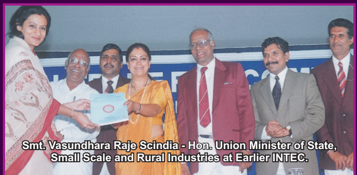
Smt. Vasundhara Raje Scindia - Hon. Union Minister of State, Small Scale and Rural Industries at Earlier INTEC.