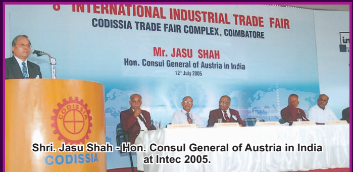
Shri. Jasu Shah - Hon. Consul General of Austria in India at Intec 2005.