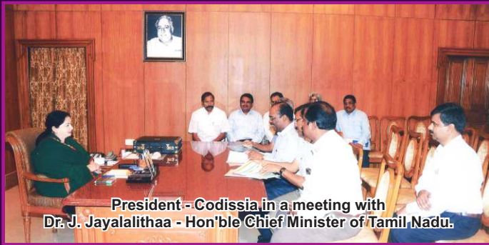
President - Codissia in a meeting with Dr. J. Jayalalithaa - Hon'ble Chief Minister of Tamil Nadu.