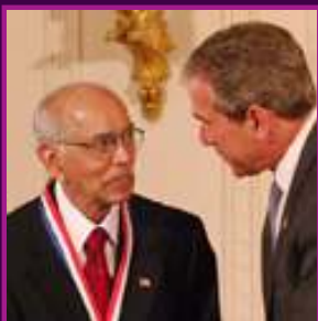
Prof. Dr. C. RADHAKRISHNA RAO Recipient of Padma Vibushan, Fellow of Royal Society of London (FRS), Head - Pennsylvania State University, USA. Scientific Advisor in Risk Analysis to US Government.