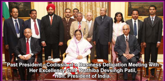
Past President - Codissia at a Business Delegation Meeting with Her Excellency Smt. Prathiba Devsingh Patil, Hon. President of India.